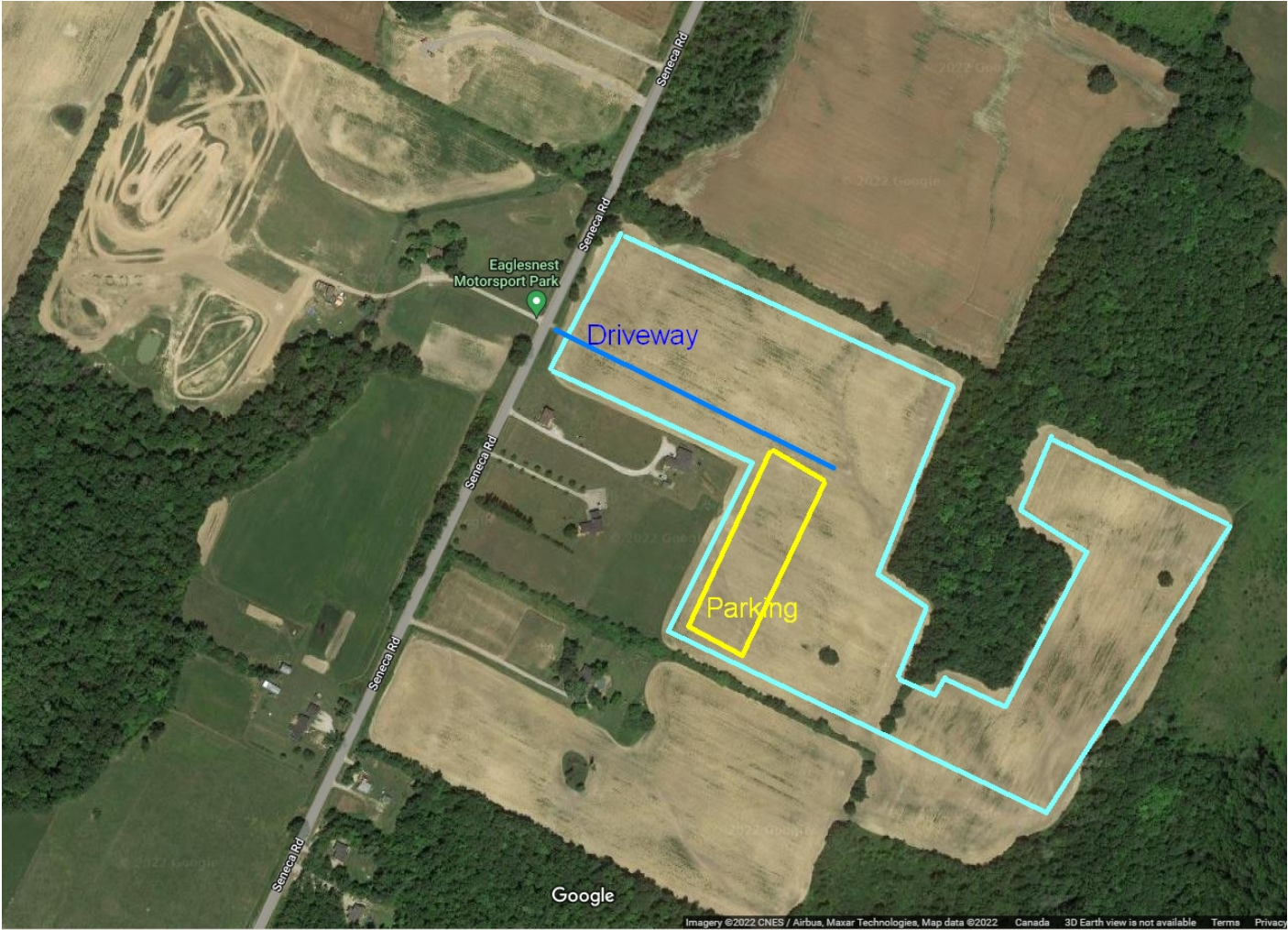
Layout showing property boundaries & parking